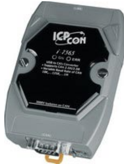
I-7565 USB to CAN Module

3000V isolation on CAN side. The CAN port of I-7565 is an isolated with 3000V isolation. This isolation can protect the local devices from the damage signal coming from CAN network.